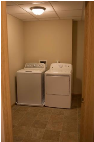
Photo Cutline: Each senior apartment has its own washer and dryer.